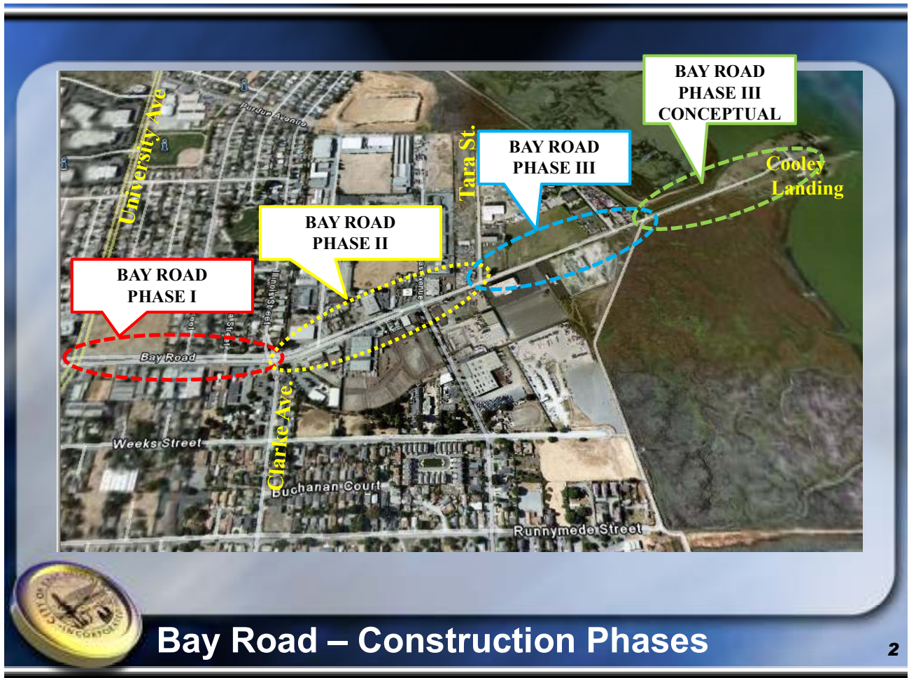
Bay Road – Construction Phases